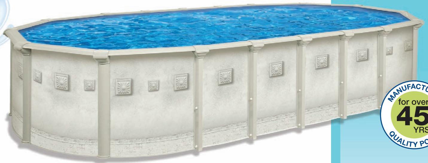
NBS oval Kamika - Tuscan wall offered in 52 inches

If you're handy with a screwdriver, then you can easily assemble your own Aquarian pool. We've designed each pool to make installation problem-free—no multi-sized washers or nuts to worry about. Just one large screw type is used to assemble the entire pool and we provide easy-to-follow instructions.