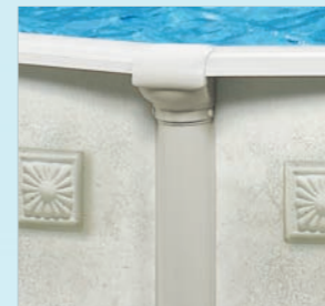
Ledge, cap and post designed for a secure fit