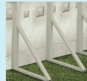
Heavy-duty angle brace system