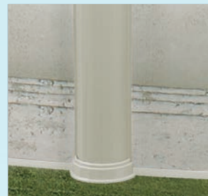
One-piece resin foot collar