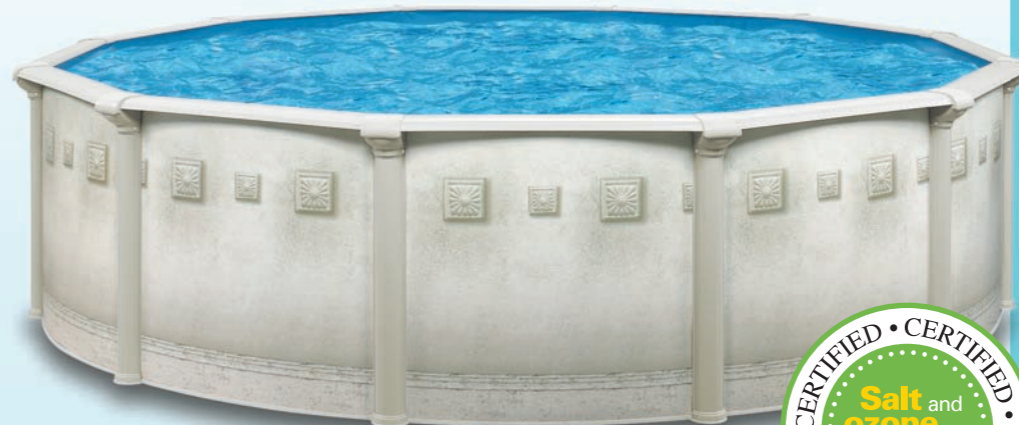
Round Kamika - Tuscan wall offered in 52 inches